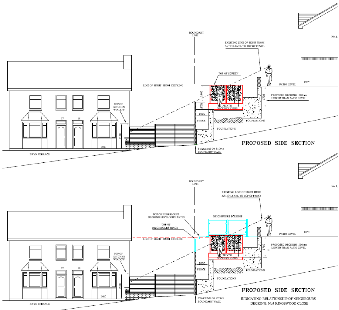
Figure 1. Revised side section indicating a 1.8 metre privacy screen and relationship of neighbouring sun deck to no. 18 Bryn Terrace

Whilst it is accepted that there is a vast difference in levels between the two properties, Members are advised that the existing situation already provides an opportunity for overlooking and the neighbouring occupier's privacy at No. 18 Bryn Terrace is already affected when standing on the existing patio directly adjacent to the rear of No. 1 Kingswood Close or when looking out from the rear habitable room windows serving the dwelling.